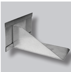
ND GARDLINER® SteelLight 110VH