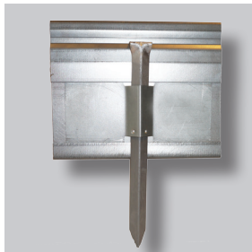
ND GARDLINER® SteelLight 160V