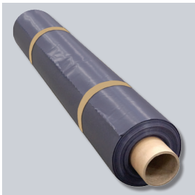
ND TGF-20 Separation and Slip Film

High-quality plastic film that acts as a separation layer and as the first smooth, non-sticky surface of the slip layer. The separation and slip film is placed on top of the waterproofing membrane underneath the ND Drainage System and helps to protect the waterproofing membrane against horizontal loading. The ND TGF-20 Separation and Slip Film should be installed with an overlap of at least 100 mm.